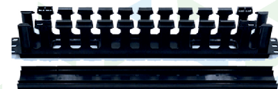
Finger Duct Type